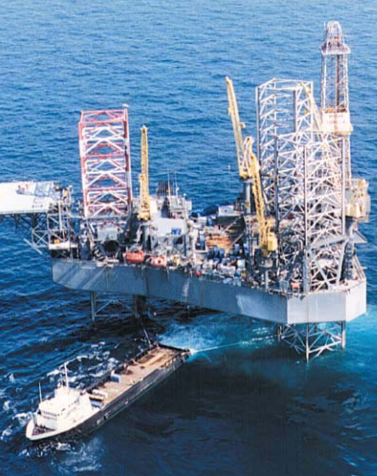
Eisworth vs. Rowan Drilling Co.