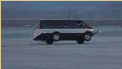
Lopez vs. Chrysler (testing)