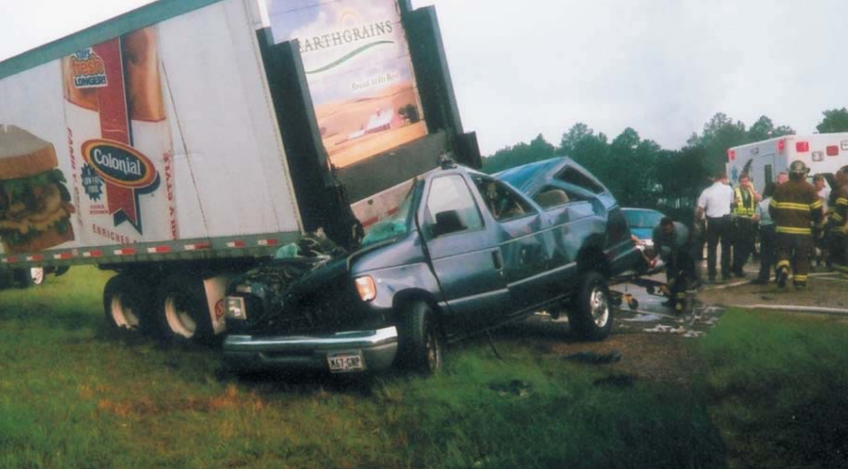
Sandoval vs. Earthgrains Baking Companies