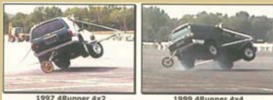
Valdez vs. Toyota (testing)