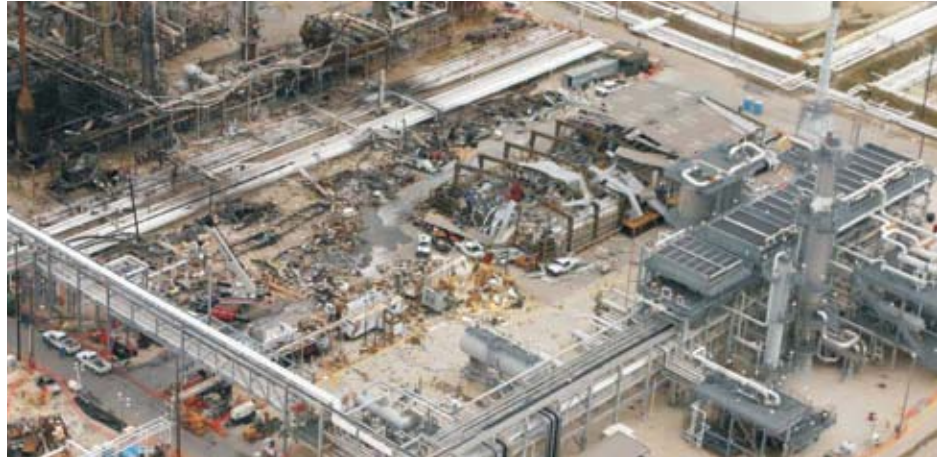
Arenazas vs. BP Amoco