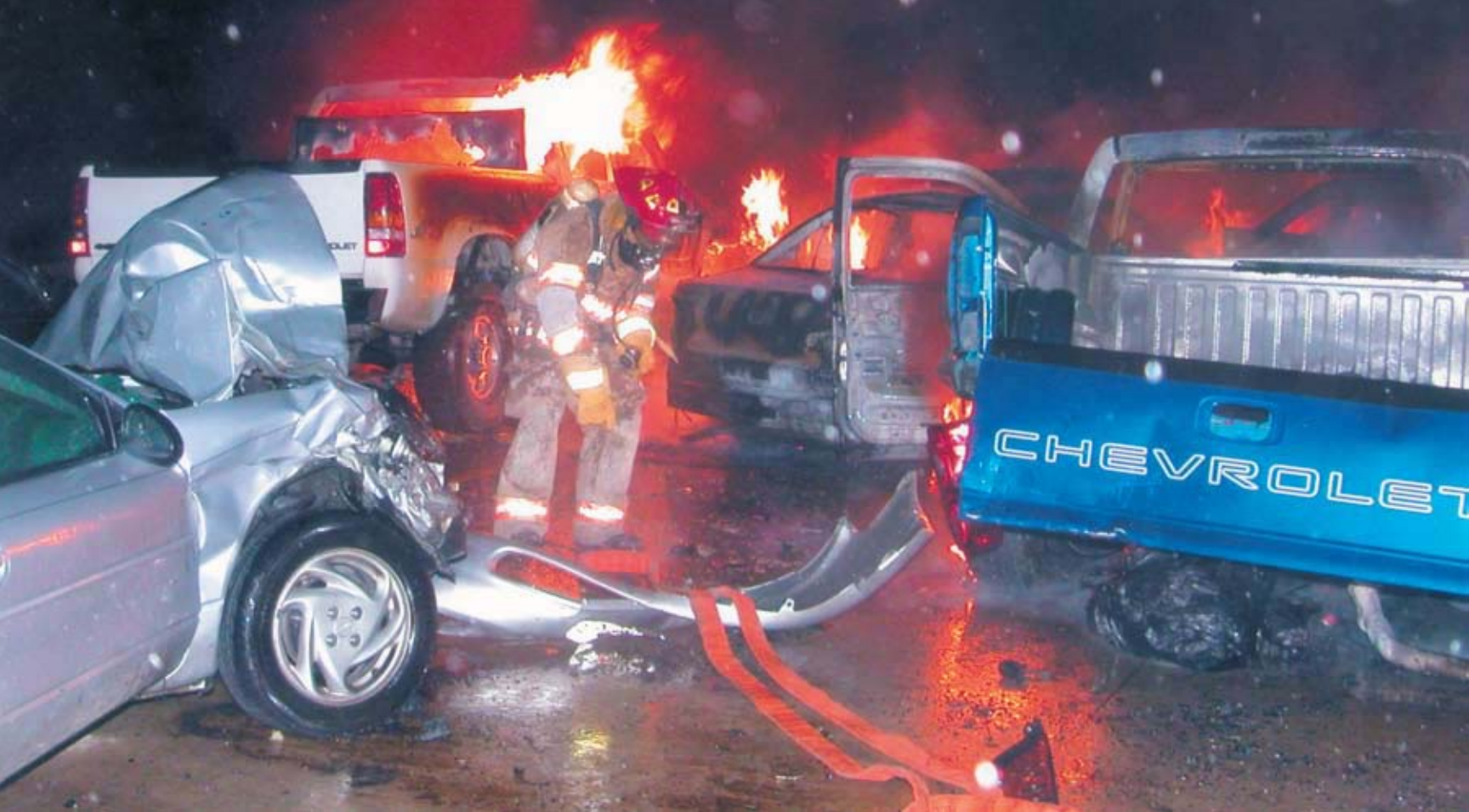
Bruton vs. General Motors